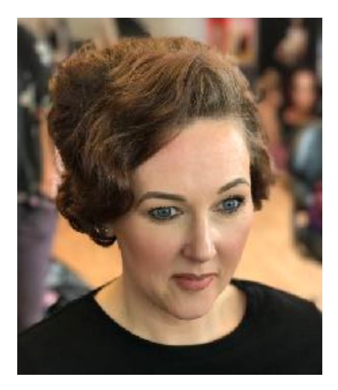
PERIOD HAIR COURSE - ENQUIRE FOR DETAILS

The course modules are taught by dedicated and experienced educators and include theory work, special projects, demonstrations and hands on workshop style learning. You will receive personal guidance and monitoring throughout the course to ensure you are achieving the learning goals required. You are provided with all of the equipment that you will need however you will be required to purchase a small kit which will include two styling heads and some hairdressing equipment however if you prefer you can buy yours separately as long as you purchase the correct equipment.